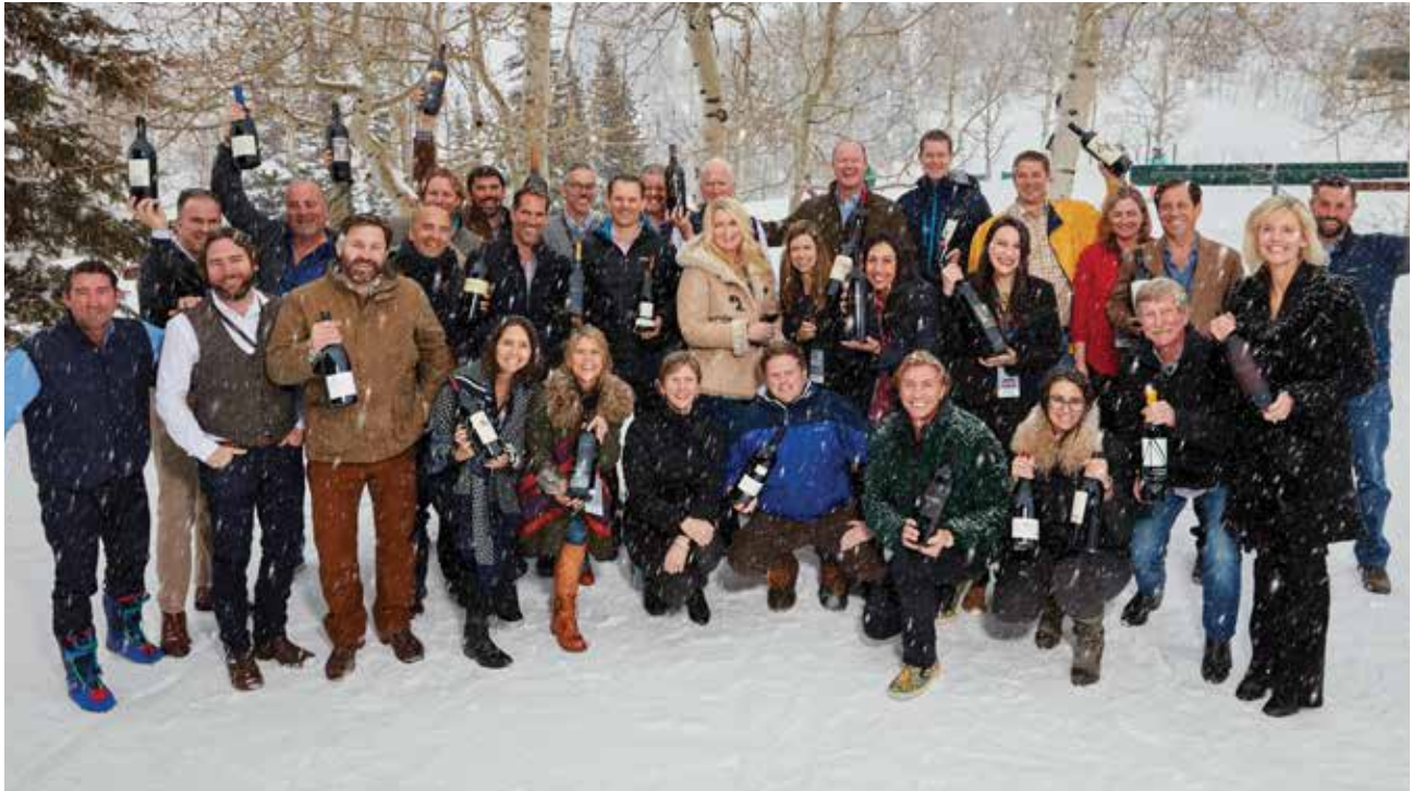
Red, White & Snow 2019 vintners.